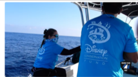
Shark Team One_Endangered Whale Shark Conservation Program.m4v