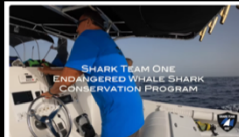
Shark Team One Endangered Whale Shark Conservation Program.mxd

https://www.sharklounge.org/en/german/white-shark-conservation-program/109