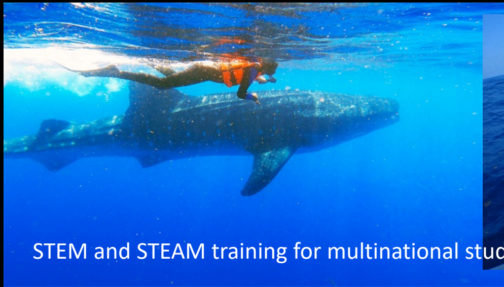
STEM and STEAM training for multinational students.